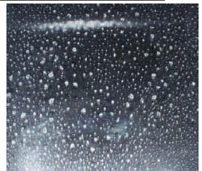
Test area with mineral contamination