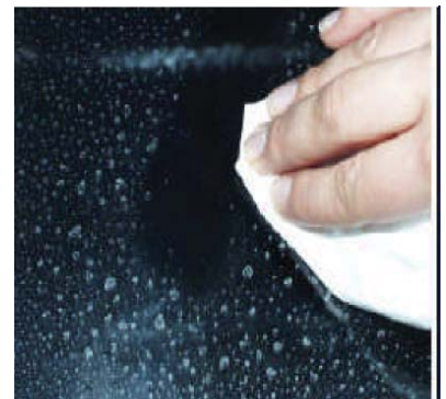
Calcium shows weak bond and can be removed with a micro fiber cloth.