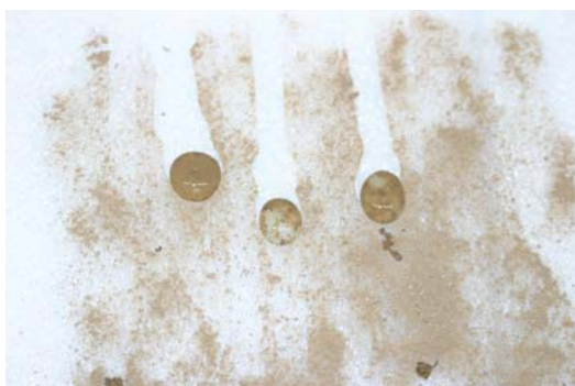
Water droplets pick up dust and dirt from a treated test panel. (self cleaning effect)