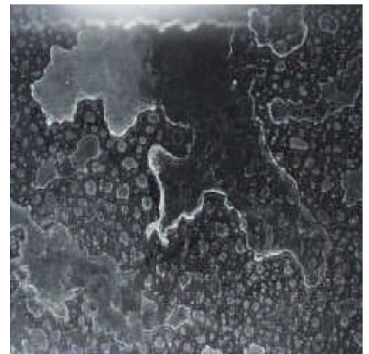
Typical glass condition at the Pinnacle

The system was found to be successful, with the glass now free of any compound build up. The treatment still fully functional and hydrophobic is easy to clean and showed a significant better performance than other coatings used.